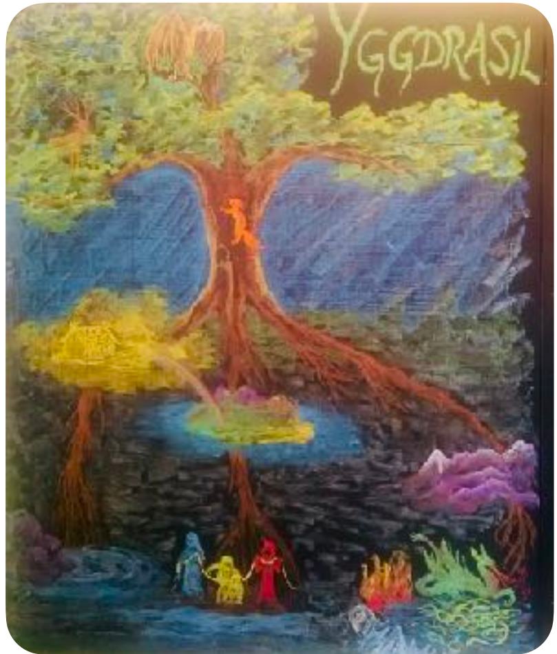
Blackboard drawing from Class 4&5 introducing Yggdrasil, the World Tree, as part of their Norse Myths main lesson block